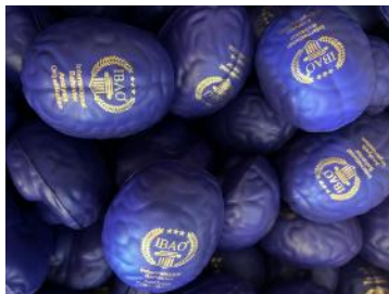
IBAO has Brains!