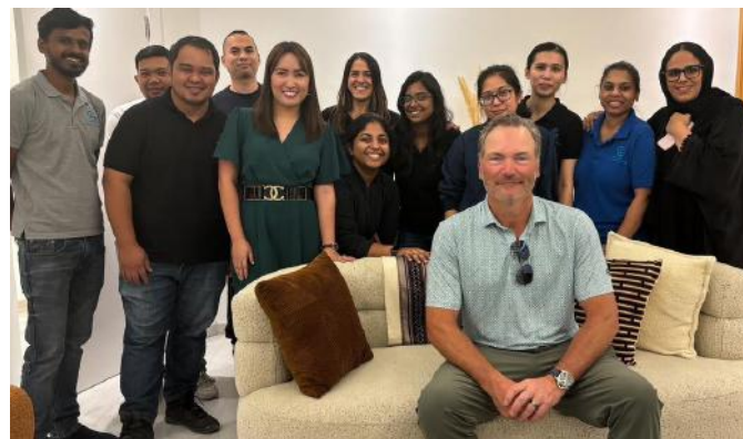
Meeting the friendly staff of the Georgetown Early Intervention Center after a tour of the new expansion!