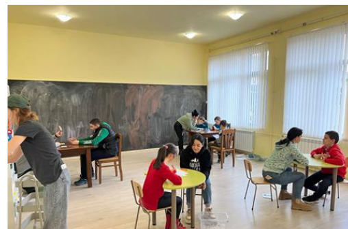
School Consultation and Training in Bulgaria!

We are about to translate all the official IBAO documents and our next step will be to provide IBT/IBA training in Bulgarian and translate the exam. So yes, we are ready to join this amazing international team and to be part of changing ABA around the world.