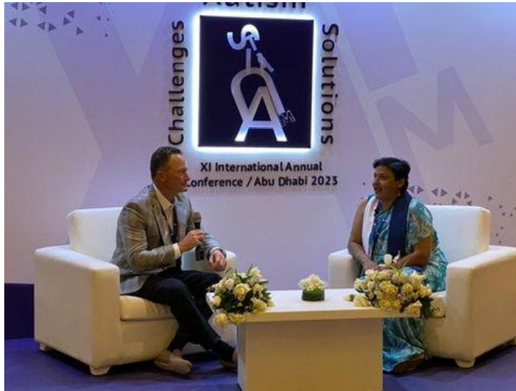
Interview at the 11th Autism Challenges - Solutions Conference